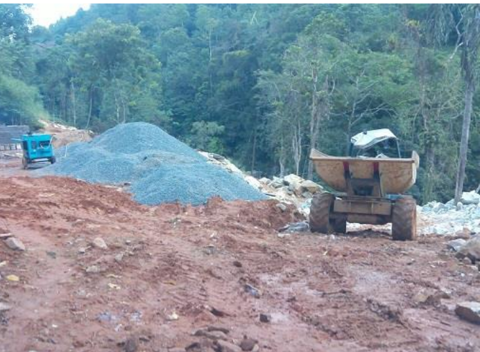
Destruction along the border of Sinharaja World Heritage Rainforest due to Koskulana Mini-Hydro Project