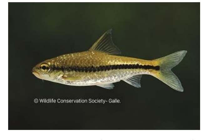
Barred Danio ( Devario Pathirana )