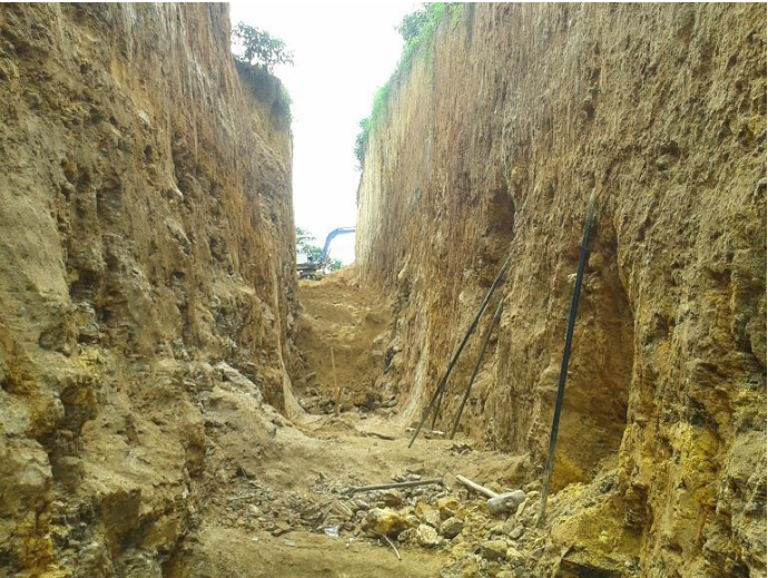
Excavation of mountain slopes and landslides in Anda Dola mini-hydro project site